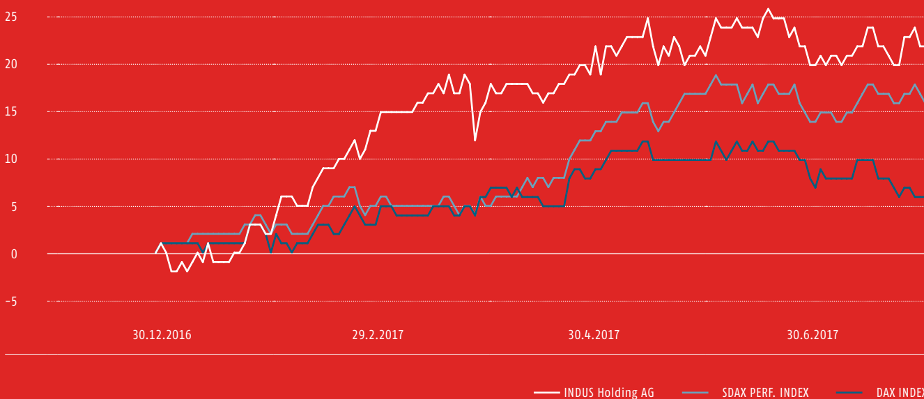
SHARE PRICE PERFORMANCE OF THE INDUS SHARE IN THE FIRST HALF-YEAR 2017 INCL. DIVIDEND (in %)