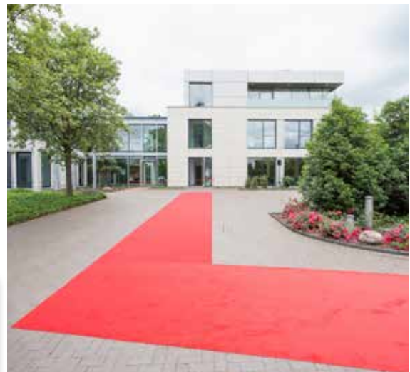
THE ADDITION THAT WAS COMPLETED IN THE SUMMER OF 2017 OFFERS SPACE FOR 18 EMPLOYEES AND THREE CONFERENCE ROOMS.