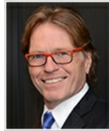
Klaus Dieter Frers