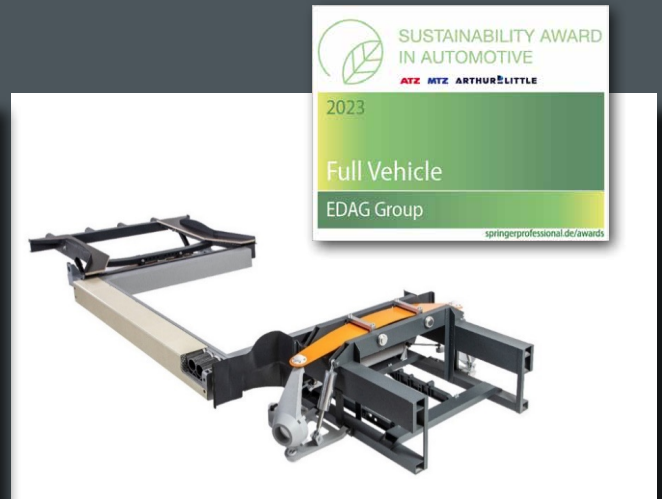
KOSEL platform demonstrator

ZOBAS has revolutionized the electric and electronic architecture of a vehicle not by interconnecting the