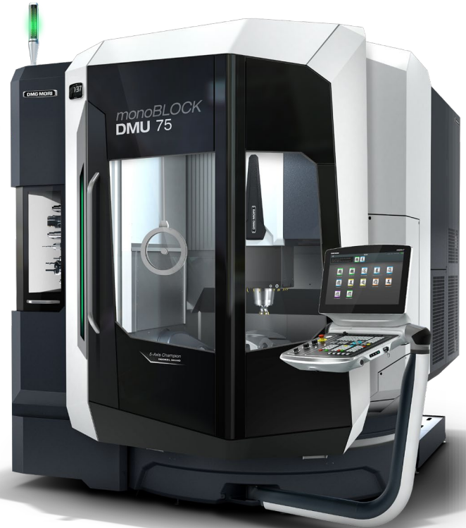
DMU 75 monoBLOCK 2 nd Gen. – highest productivity, among others through technology integration. Thus up to 5 integrated processes are possible on one machine.

DMU 65/75 monoBLOCK 2 nd Gen. – Highly accurate, temperature stable and productive: The compact and easy-to-automate DMU 65 and 75 monoBLOCK of the second generation combine the experience gained from more than 6,000 machines supplied in the monoBLOCK series with 30% higher volumetric accuracy, 20% better temperature stability and maximum productivity by integrating milling, turning, grinding, gear cutting and measuring on one machine. The consistent combination of machines, technologies, users, automation and digitization enables a high degree of process integration for resource-saving and efficient production.