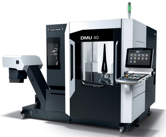
DMU 40 – universal, compact, powerful. The perfect entry into 5-axis simultaneous machining.