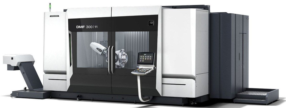
DMF 300|11 – modular design, highly flexible, highly efficient. Three linear guides in the X-axis ensure maximum rigidity and accuracy.