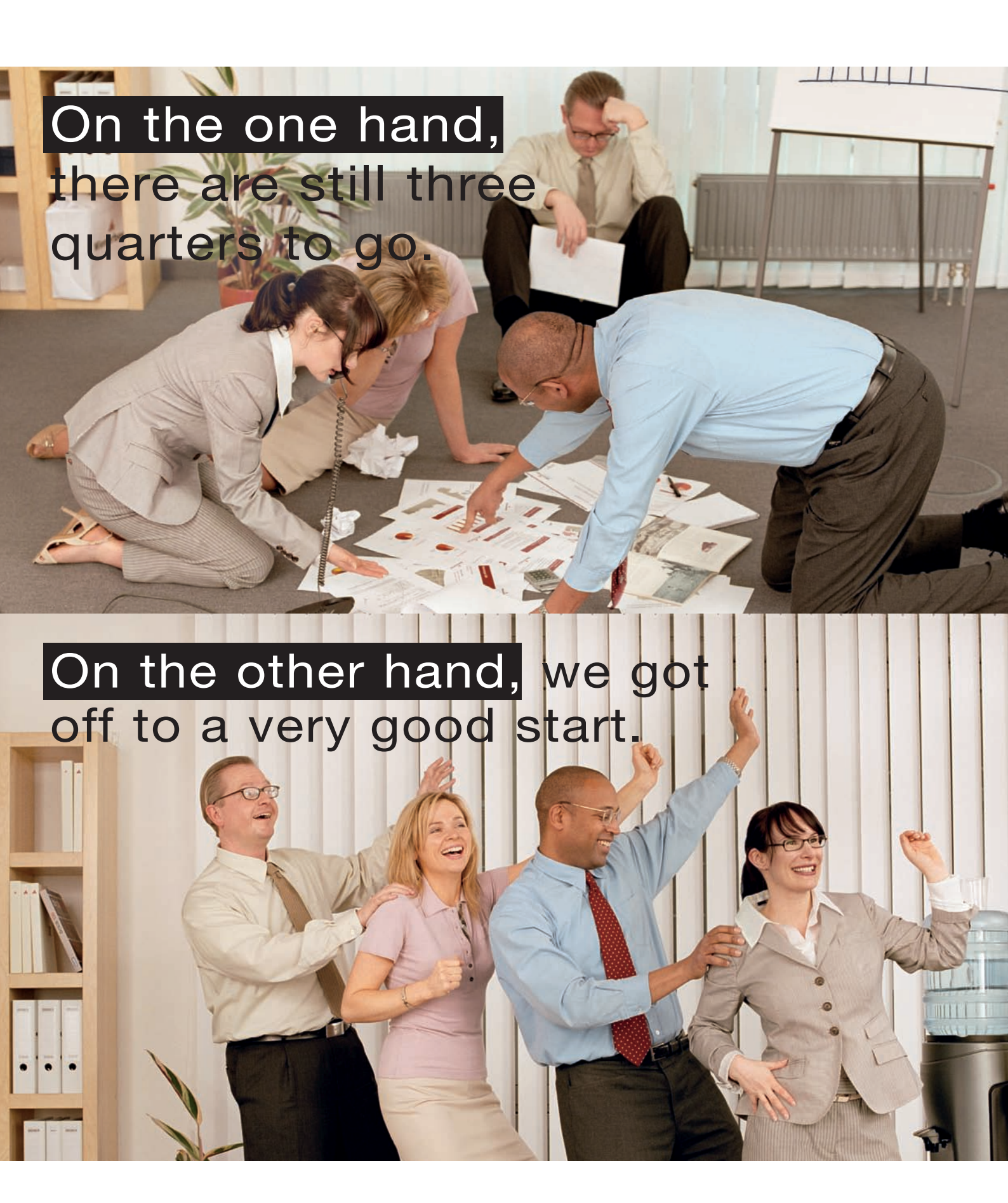
Report on the First Quarter 2007